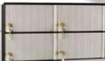
4 Doors 10 3/4"W x 5 1/2"H