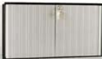
1 Door 22"W x 11 1/2"H