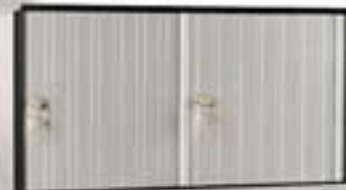
2 Doors 10 3/4"W x 11 1/2"H