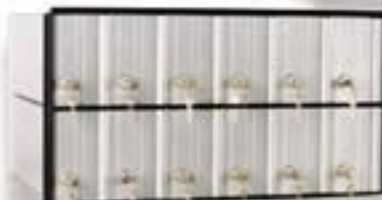
12 Doors 3 1/2"W x 5 1/2"H