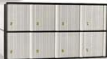
8 Doors 5 1/2"W x 5 1/2"H